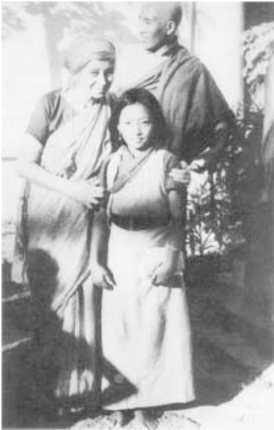
With a Tibetan girl. In the background is a Tibetan lama. Photographed on 5 Feb. 1962.